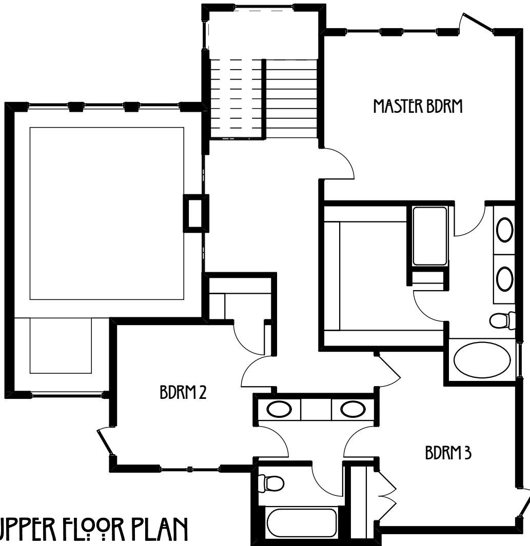
UPPER FLOOR PLAN 1079 SQ. FT.